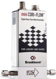
MINI CORI-FLOW™ M12