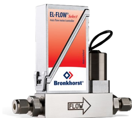
EL-FLOW SELECT F-201CV

Min. flow 0,16...8 mln/min Max. flow 0,5...25 lln/min Pressure rating 64 bar Compact design High accuracy and repeatability