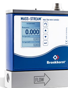
MASS-STREAM D-6321 MFC

Min. flow 0,4...20 l/min Max. flow 0,6...100 l/min Pressure rating 100 bar Compact IP65 design High accuracy