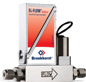
EL-FLOW SELECT F-201CV

Min. flow 0...10 ml/min Max. flow 0...5 l/min Pressure rating 10 bar Ultra compact MEMS technology