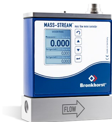
MASS-STREAM D-6310 MFM

Min. flow 0,01...0,2 l/min Max. flow 0,1...2 l/min Pressure rating up to 20 bar Rugged sensor and housing (IP65) Optional integrated TFT display