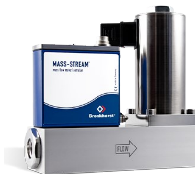
MASS-STREAM D-6371/004BI MFC

Min. flow 0,01...0,2 l/min Max. flow 0,1...2 l/min Pressure rating up to 20 bar Rugged sensor and housing (IP65) Optional integrated TFT display