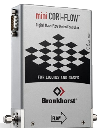
MINI CORI-FLOW™ ML120V00

Min. flow 0,05...5 g/h Max. flow 2...200 g/h Pressure rating 200 bar Independent of fluid properties High accuracy, fast measurement