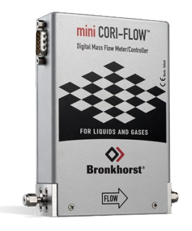
MINI CORI-FLOW™ ML120V00

Flow range 0...200 g/h Pressure rating 5 bar Independent of fluid properties High accuracy, control