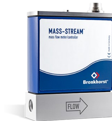
MASS-STREAM D-6341 MFC