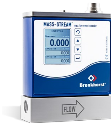
MASS-STREAM D-6310 MFM