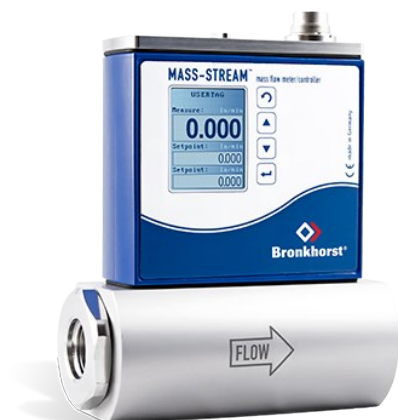
MASS-STREAM D-6370 MFM

Min. flow 2...100 l/min Max. flow 10...1000 l/min Pressure rating up to 20 bar Rugged sensor and housing (IP65) Optional integrated TFT display