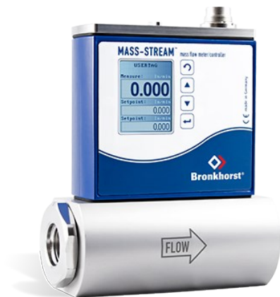
MASS-STREAM D-6370 MFM

Min. flow 2...100 l/min Max. flow 10...1000 l/min Pressure rating up to 20 bar Rugged sensor and housing (IP65) Optional integrated TFT display