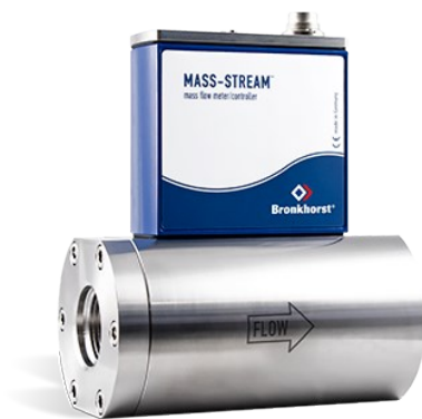
MASS-STREAM D-6380 MFM

Min. flow 2...100 l/min Max. flow 10...1000 l/min Pressure rating up to 20 bar Rugged sensor and housing (IP65) Optional integrated TFT display