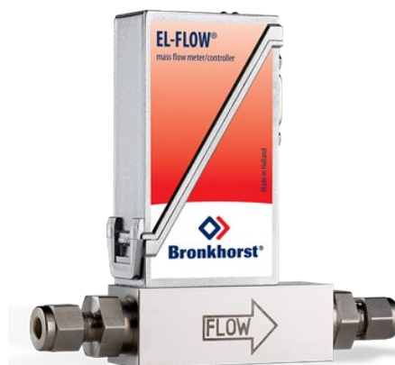
EL-FLOW SELECT F-111B

Min. flow 0,16...8 ml/min Max. flow 0,5...25 l/min Pressure rating 64 bar Compact design High accuracy and repeatability