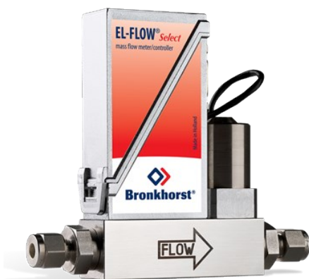
EL-FLOW SELECT F-201CV

Min. flow 0,16...8 ml/min Max. flow 0,5...25 l/min Pressure rating 64 bar Compact design High accuracy and repeatability