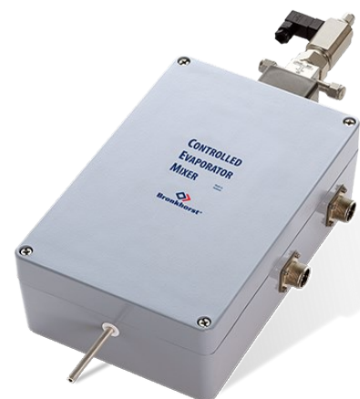
CEM EVAPORATOR W-303B

Max. 120 g/h liquid; Max. 10 l/min gas Pressure rating 100 bar Very stable vapor flow Flexible gas/liquid ratio