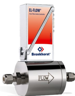
EL-FLOW SELECT F-112AC

Min. flow 0,8...40 l/min Max. flow 1,4...250 l/min Pressure rating 100 bar Compact design High accuracy