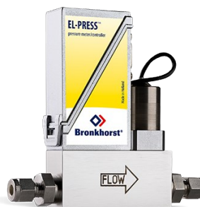
EL-PRESS P-702CV (P1-CONTROL)

Min. flow 0,4...20 l/min Max. flow 2...200 l/min Pressure rating up to 20 bar Rugged sensor and housing (IP65) Optional integrated TFT display