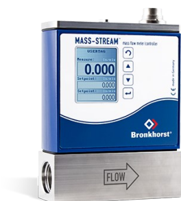
MASS-STREAM D-6360 MFM

Min. flow 0,8...40 l/min Max. flow 1,4...250 l/min Pressure rating 100 bar Compact design High accuracy