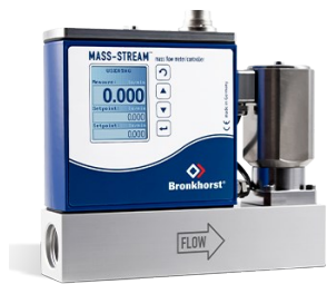
MASS-STREAM D-6361A/002BI MFC

Min. flow 0,4...20 l n /min Max. flow 4...200 l n /min Pressure rating up to 20 bar Rugged sensor and housing (IP65) Optional integrated TFT display