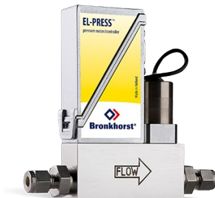
EL-PRESS P-702CV (P1-CONTROL)

Min. flow 0,4...20 l n /min Max. flow 4...200 l n /min Pressure rating up to 20 bar Rugged sensor and housing (IP65) Optional integrated TFT display