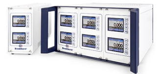
E-8000 SERIES DIGITAL READOUT / CONTROL SYSTEMS

Min. flow 0,16...8 ml n /min Max. flow 0,5...25 l n /min Pressure rating 64 bar Compact design High accuracy and repeatability