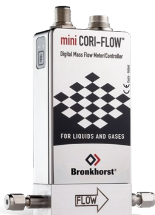
MINI CORI-FLOW™ M14

Min. flow 0,03...1 kg/h Max. flow 0,3...30 kg/h Pressure rating 200 bar Independent of fluid properties High accuracy, fast response