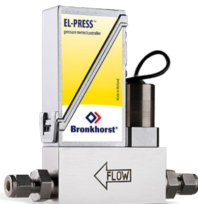
EL-PRESS P-602CV (P2-CONTROL)

Min. flow 0,16...8 mln/min Max. flow 0,5...25 lln/min Pressure rating 64 bar Compact design High accuracy and repeatability