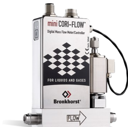
MINI CORI-FLOW™ M14V14I

Compact assembly ensures space efficiency Economical solution, low cost of ownership Combination of functions on one manifold