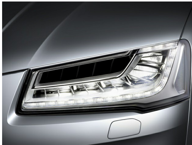
LED headlamp

Part of the headlamp manufacturing process is applying a UV-resistant varnish on the transparent lens, and a chrome-like coating on the reflector, both applied by a coating robot, involving several coating steps. As the quality of the applied coatings during initial testing was not constant, HELLA asked Bronkhorst for assistance. Due to the use of Bronkhorst mass flow meters, HELLA was able to analyse the application process accurately, and to identify essential steps in the process to improve the coating quality.