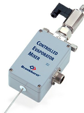
CEM EVAPORATOR W-102A

Min. flow 0,1...5 g/h Max. flow 2...200 g/h Pressure rating 200 bar Independent of fluid properties High accuracy, fast response