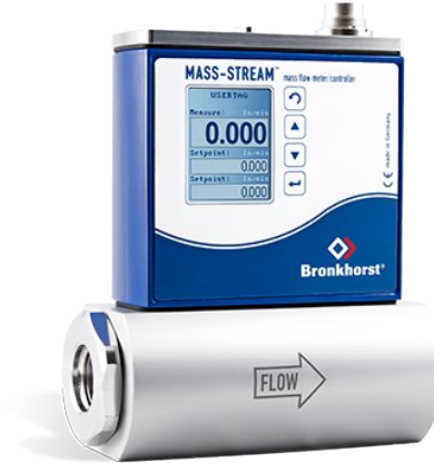
MASS-STREAM D-6370 MFM

Min. flow 0,01...0,2 l/min Max. flow 0,1...2 l/min Pressure rating up to 20 bar Rugged sensor and housing (IP65) Optional integrated TFT display