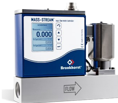
MASS-STREAM D-6361/002BI MFC

Min. flow 40...2000 l/min Max. flow 100...10000 l/min Pressure rating up to 20 bar Rugged sensor and housing (IP65) Optional integrated TFT display