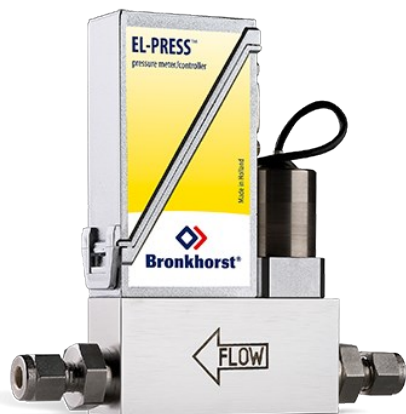
EL-PRESS P-602CV (P2-CONTROL)

Min. pressure 5...100 mbar Max. pressure 3,2...64 bar Absolute or gauge pressure High accuracy