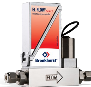
EL-FLOW SELECT F-201CV

Pression min. 20...100 mbar Pression max. 12,8...64 bar Pression absolue ou relative Grande précision