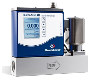
MASS-STREAM D-6361A/002BI MFC

Débit min. 0,4...20 l n /min Débit max. 10...500 l n /min Pression jusqu'à 20 bar Boîtier robuste (IP65) Option afficheur TFT intégré