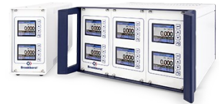
E-8000 SERIES DIGITAL READOUT / CONTROL SYSTEMS

Débit min. 0,16...8 ml n /min Débit max. 0,5...25 l n /min Pression 64 bar Conception compacte Grande précision, excellente répétabilité