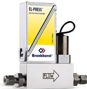
EL-PRESS P-702CV (P1-CONTROL)

Débit min. 0,4...20 l n /min Débit max. 10...500 l n /min Pression jusqu'à 20 bar Boîtier robuste (IP65) Option afficheur TFT intégré