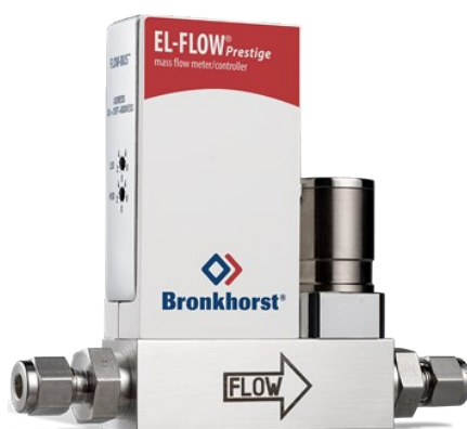
EL-FLOW PRESTIGE FG-201CV

Débit min. 0,1...5 g/h Débit max. 2...200 g/h Pression 200 bar Indépendant des propriétés du fluide Grande précision