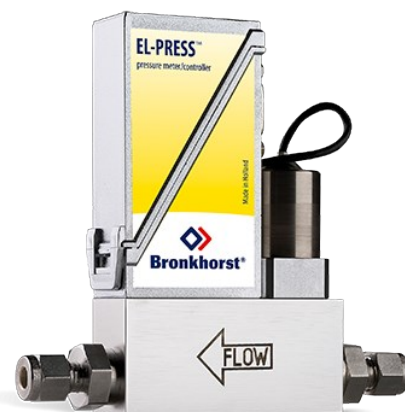
EL-PRESS P-612CV (P2-CONTROL)

Débit min. 0,14...7 ml/min Débit max. 0,4...20 l/min Pression 64 bar 100 gaz sélectionnables Configurations I/O personnalisées