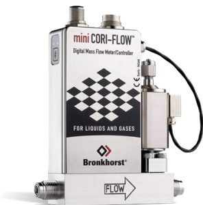
MINI CORI-FLOW™ M12V141

The Bronkhorst Coriolis devices are used here because of their high accuracy, and because they are able to directly supply a certain mass of water regardless of process conditions such as ambient temperature and pressure. Furthermore, water properties such as its temperature and density can be read in real-time. The maximum temperature of the water used at the Grimsel Test Site, which is located at a depth of 400 to 500 meters, is 40°C (only during the thermal tests). This setup is a robust, reliable, flexible, compact and easy-touse way to control the water supply. To track their experiments, the researchers from ETH Zürich use Bronkhorst software, including FlowPlot to make a plot of the entire experiment. Furthermore, they have the possibility using TeamViewer to control, view and monitor the setup at Grimsel from a remote location, so they do not have to be at the Test Site the entire period of time.