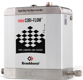
MINI CORI-FLOW™ M15