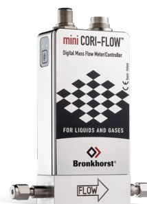
MINI CORI-FLOW™ M12

Débit min. 0,25 ... 5 g/h Débit max. 5 ... 100 g/h Pression 100 bar Conception compacte, IP40 Communication analogique, RS232 ou de fieldbus