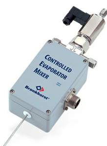
CEM EVAPORATOR W-202A

Débit min. 0,16...8 mln/min Débit max. 0,5...25 l/min Pression 64 bar Conception compacte Grande précision, excellente répétabilité