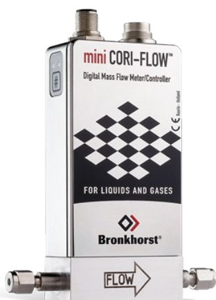
MINI CORI-FLOW™ M12

Débit min. 0,1...5 g/h Débit max. 2...200 g/h Pression 200 bar Indépendant des propriétés du fluide Grande précision