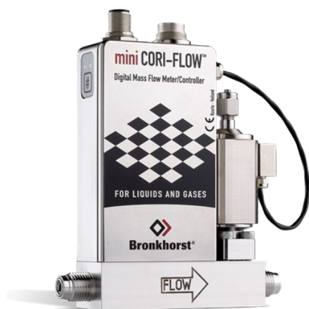
MINI CORI-FLOW™ M13V14I

Débit min. 1...50 g/h Débit max. 20...2000 g/h Pression 100 bar Indépendant des propriétés du fluide Grande précision