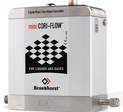
MINI CORI-FLOW™ M15

Débit min. 0,05...5 g/h Débit max. 2...200 g/h Pression 200 bar Indépendant des propriétés du fluide Grande précision