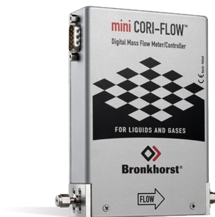
MINI CORI-FLOW™ ML120V00

Débit min. 1...50 g/h Débit max. 20...2000 g/h Pression 100 bar Indépendant des propriétés du fluide Grande précision