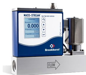
MASS-STREAM D-6361/002BI MFC

Débit min. 0,14...7 l/min Débit max. 1...50 l/min Pression jusqu'à 20 bar Boîtier robuste (IP65) Option afficheur TFT intégré