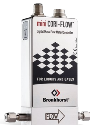
MINI CORI-FLOW™ M12

Débit min. 0,4...20 l/min Débit max. 0,6...100 l/min Pression 64 bar Conception compacte Grande précision, excellente répétabilité