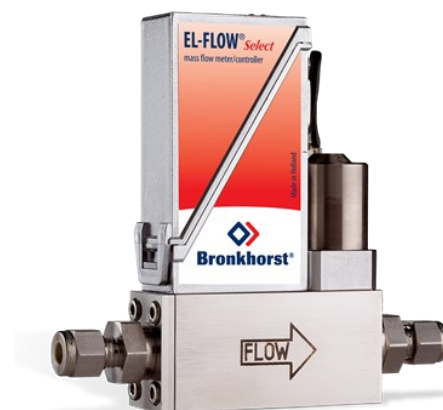
EL-FLOW SELECT F-201AV

Max. 30 g/h liquide; Max. 4 l/min gaz Pression 100 bar Débit de vapeur très stable Ratio de gaz/liquide flexible