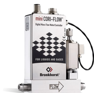
MINI CORI-FLOW™ M14V14I

Débit 0...7 kg/h Pression 100 bar Indépendant des propriétés du fluide Grande précision