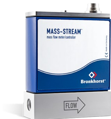
MASS-STREAM D-6341 MFC

Débit min. 0,14...7 l/min Débit max. 1...50 l/min Pression jusqu'à 20 bar Boîtier robuste (IP65) Option afficheur TFT intégré