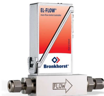
EL-FLOW SELECT F-111B

Débit min. 0,16...8 mln/min Débit max. 0,5...25 lln/min Pression 64 bar Conception compacte Grande précision, excellente répétabilité