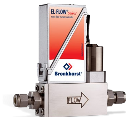
EL-FLOW SELECT F-211AV

Débit min. 0,4...20 l/min Débit max. 0,6...100 l/min Pression 64 bar Conception compacte Grande précision, excellente répétabilité