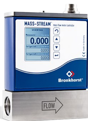
MASS-STREAM D-6360 MFM

Débit min. 0,8...40 l/min Débit max. 1,4...250 l/min Pression jusqu'à 100 bar Conception compacte, IP65 Grande précision