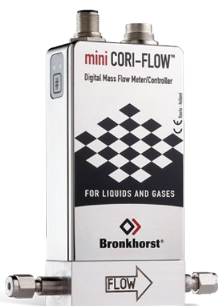
MINI CORI-FLOW™ M12

Débit min. 0,25 ... 5 g/h Débit max. 5 ... 100 g/h Pression 100 bar Conception compacte, IP40 Communication analogique, RS232 ou de fieldbus