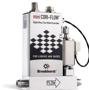
MINI CORI-FLOW™ M13V141