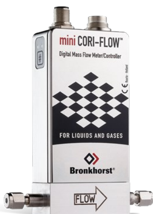
MINI CORI-FLOW™ M14

Débit min. 0,03...1 kg/h Débit max. 0,3...30 kg/h Pression 200 bar Indépendant des propriétés du fluide Grande précision