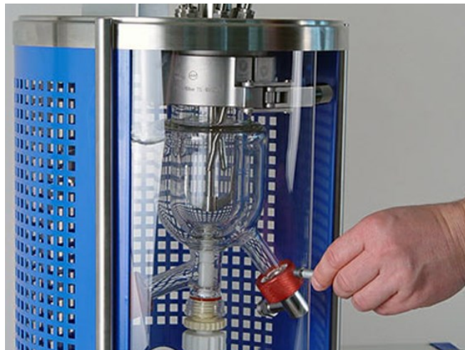
Compact lab reactor system for low and high pressure reactions, with interchangeable glass and steel pressure vessels

Bronkhorst has developed a specialised combination of electronic pressure and thermal mass flow controllers for automated pressure control of reactor vessels. This standard solution can be applied for low flow lab reactor systems as well as for high flow industrial applications as for instance in hydrogenation processes in the food and pharma industry or at chemical plants, at either low or (very) high pressure (up to 400 bar).