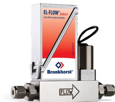
EL-FLOW SELECT F-201CV

Débit min. 0,16...8 mln/min Débit max. 0,5...25 lln/min Pression 64 bar Conception compacte Grande précision, excellente répétabilité