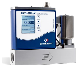
MASS-STREAM D-6361/002BI MFC

Débit min. 0,14...7 l/min Débit max. 1...50 l/min Pression jusqu'à 20 bar Boîtier robuste (IP65) Option afficheur TFT intégré