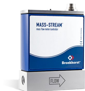
MASS-STREAM D-6341 MFC

Débit min. 0,14...7 l/min Débit max. 1...50 l/min Pression jusqu'à 20 bar Boîtier robuste (IP65) Option afficheur TFT intégré