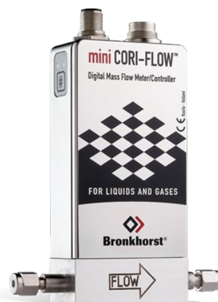
MINI CORI-FLOW™ M12

Débit min. 0,4...20 l/min Débit max. 0,6...100 l/min Pression 64 bar Conception compacte Grande précision, excellente répétabilité