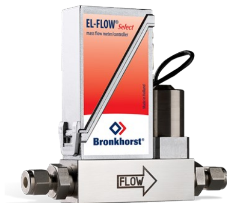
EL-FLOW SELECT F-201CV

Débit min. 0,16...8 mln/min Débit max. 0,5...25 lln/min Pression 64 bar Conception compacte Grande précision, excellente répétabilité