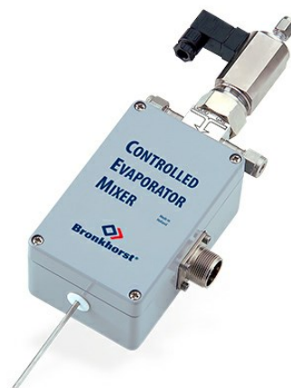
CEM EVAPORATOR W-102A

Débit min. 0,1...5 g/h Débit max. 2...200 g/h Pression 200 bar Indépendant des propriétés du fluide Grande précision