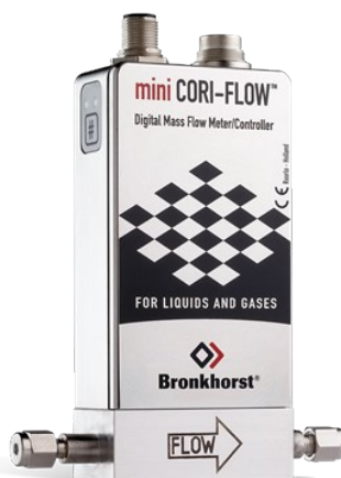
MINI CORI-FLOW™ M12

Débit min. 0,16...8 mln/min Débit max. 0,5...25 lln/min Pression 64 bar Conception compacte Grande précision, excellente répétabilité