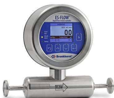
ES-FLOW™ ES-1031 Ultrasonic flow meter for low flow rates

Many types of nutrients, buffer solutions and reagents are involved to create an optimal environment for microorganisms. Therefore, a wide liquid compatibility of instrumentation is needed. Also, liquid-independent measurement and control of mass or volume are necessary. Since small and large liquid doses could be needed in different situations, a large dynamic range of dosing equipment is much desired. Bronkhorst instruments mini-CORI-FLOW and ES-FLOW are dedicated to provide these requirements and offer compact alternatives for weighing scales. ES-FLOW is specifically suitable for several cleaning methods.