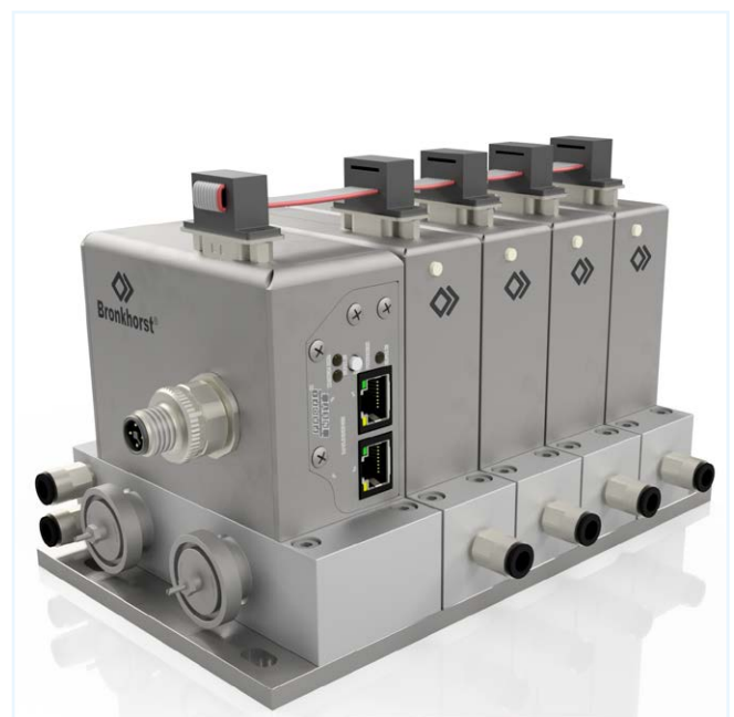
Artist impression of a customised, multi-channel flow solution