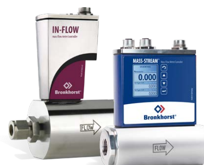
Industrial (IP65) Thermal Mass Flow Meters for Gases