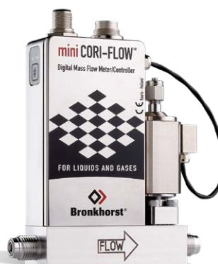
MINI CORI-FLOW™ M13V141 Low Flow Coriolis Mass Flow Controller for Liquids and Gases