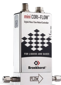
MINI CORI-FLOW™ MXX

Min. flow 0,05...5 ml/h Max. flow 3...300 l/h Pressure rating up to 200 bar High accuracy, fast response Density and temperature output