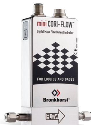
MINI CORI-FLOW™ M12

Min. flow 0,4...20 l/min Max. flow 0,6...100 l/min Pressure rating 64 bar Compact design High accuracy and repeatability