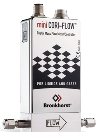
MINI CORI-FLOW™ M13

Min. flow 1...50 g/h Max. flow 20...2000 g/h Pressure rating 200 bar Independent of fluid properties High accuracy, fast response