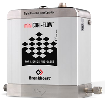
MINI CORI-FLOW™ M15

Min. flow 1...50 g/h Max. flow 20...2000 g/h Pressure rating 100 bar Independent of fluid properties High accuracy, fast control