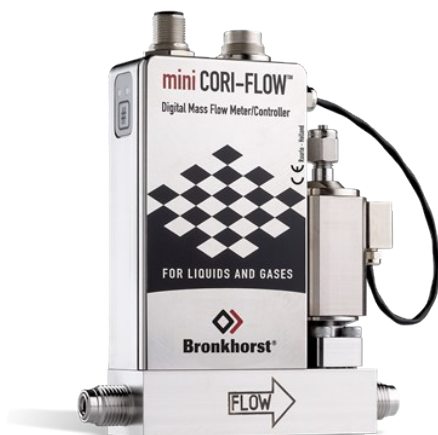
MINI CORI-FLOW™ M13V14I

Min. flow 0,1...5 g/h Max. flow 2...200 g/h Pressure rating 100 bar Independent of fluid properties High accuracy, fast control