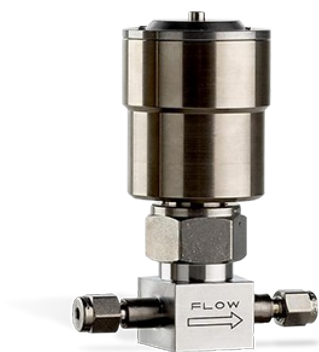
SERIES C2I, C5I

Min. flow 0,2...5 kg/h Max. flow 3...300 kg/h Pressure rating 100 bar Independent of fluid properties High accuracy, fast response