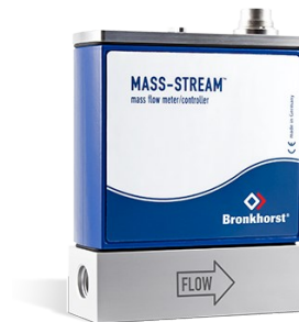
MASS-STREAM D-6341 MFC

Min. flow 0,01...0,2 l/min Max. flow 0,1...2 l/min Pressure rating up to 20 bar Rugged sensor and housing (IP65) Optional integrated TFT display