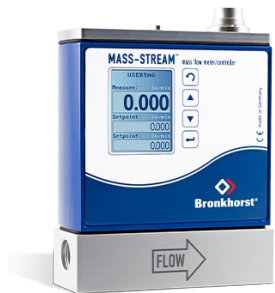
MASS-STREAM D-6310 MFM

Min. flow 0,01...0,2 l/min Max. flow 0,1...2 l/min Pressure rating up to 20 bar Rugged sensor and housing (IP65) Optional integrated TFT display