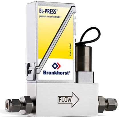
EL-PRESS P-702CV (P1-CONTROL)

Min. flow 0,4...20 l/min Max. flow 2...200 l/min Pressure rating up to 20 bar Rugged sensor and housing (IP65) Optional integrated TFT display