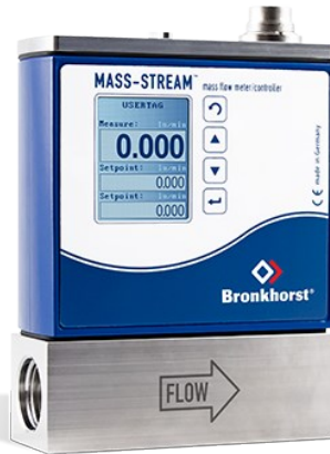
MASS-STREAM D-6360 MFM

Min. flow 0,8...40 l/min Max. flow 1,4...250 l/min Pressure rating 100 bar Compact design High accuracy