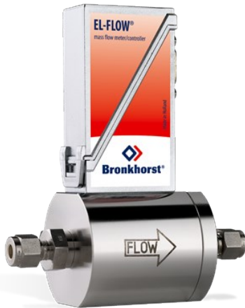
EL-FLOW SELECT F-112AC

Min. flow 0,8...40 l/min Max. flow 1,4...250 l/min Pressure rating 100 bar Compact design High accuracy