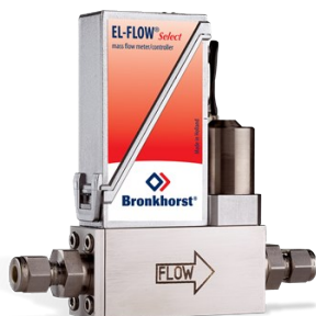
EL-FLOW SELECT F-201AV

Min. flow 0,4...20 l/min Max. flow 0,6...100 l/min Pressure rating 64 bar Compact design High accuracy and repeatability