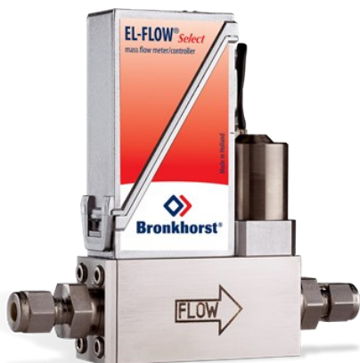
EL-FLOW SELECT F-201AV

Min. flow 0,4...20 l/min Max. flow 0,6...100 l/min Pressure rating 64 bar Compact design High accuracy and repeatability