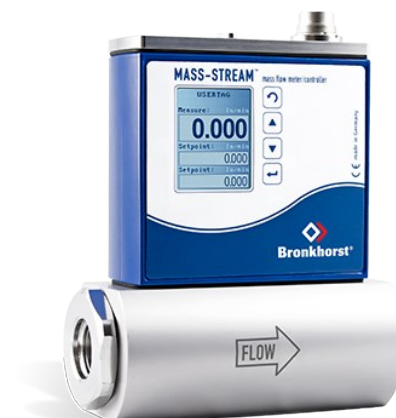
MASS-STREAM D-6370 MFM

Min. flow 17...500 l/min Max. flow 167...5000 l/min Pressure rating up to 16 bar Rugged sensor and housing (IP65) Optional integrated TFT display