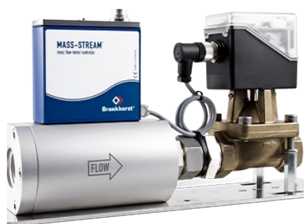
MASS-STREAM D-6383/BJ-1" MFC

Min. flow 0,4...20 l/min Max. flow 4...200 l/min Pressure rating up to 20 bar Rugged sensor and housing (IP65) Optional integrated TFT display