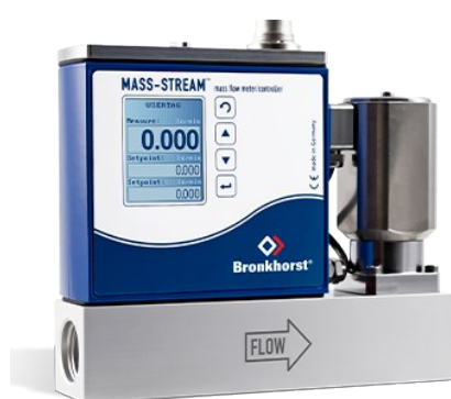
MASS-STREAM D-6361/002BI MFC

Min. flow 0,4...20 l/min Max. flow 4...200 l/min Pressure rating up to 20 bar Rugged sensor and housing (IP65) Optional integrated TFT display