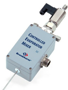
CEM EVAPORATOR W-102A

Max. 30 g/h liquid; Max. 4 l/min gas Pressure rating 100 bar Very stable vapour flow Flexible gas/liquid ratio