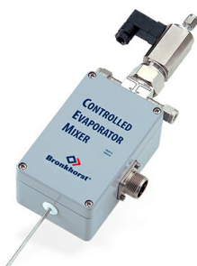
CEM EVAPORATOR W-202A

Max. 30 g/h liquid; Max. 4 l/min gas Pressure rating 100 bar Very stable vapour flow Flexible gas/liquid ratio